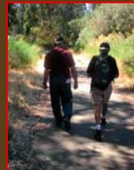
Residents enjoy a leisurely walk along the former Sacramento Northern Right-of-Way. Several CALTRANS former highway parcels were acquired "at cost" provided they be used for alternative transportation as trails.