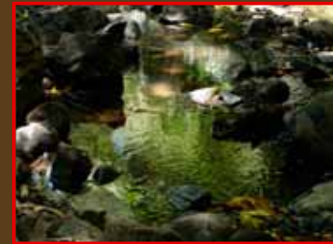
The last remaining stretch of Shepherd Creek from below the Fire Station to Scout Road was saved under the plan.

The Plan provided for setting aside 34 acres of the canyon as open space and included trails to provide alternative modes of transportation in the Canyon. The "Rails to Trails" program provided the bridge over Snake Road and other trail improvements. Special design review guidelines for residential construction were adopted. Shepherd Canyon Road (then upper Park Boulevard) received its current name.