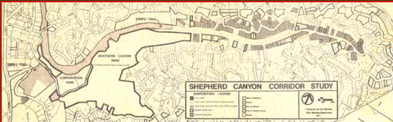
Adopted as the "Specific Plan" for Shepherd Canyon in 1975, the Plan is still used today by residents and the city.