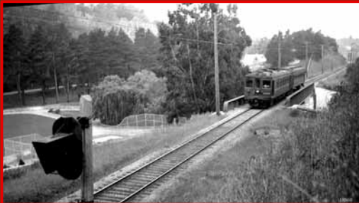
A two-car passenger train crosses over Mountain Boulevard. Note Montclair Park to the left, the old Montclair fire station above the train, and the bridge abutments all still here today.