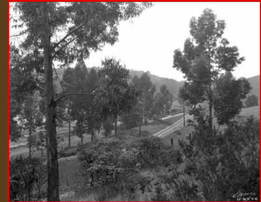
The platform at Montclair Station is empty in a quiet moment between trains.