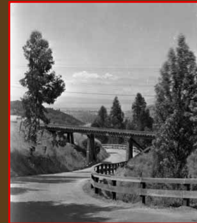
Today, instead of a trestle for trains, we have a bridge for people and bicycles to cross Snake Road.