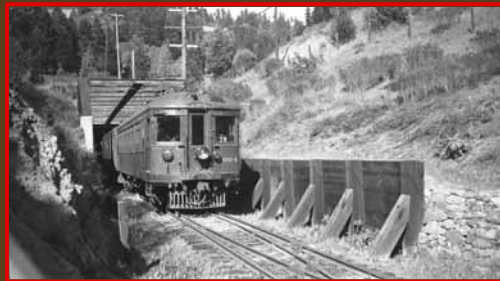
Combine 1004 emerges out of the Shepherd Canyon tunnel near current day Gunn Road heading towards Montclair in 1937.

If you would like to ride some of these original interurban trains, you still can at the Western Railway museum in Rio Vista, CA. Visit www.wrm.org for more information.