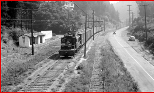
A freight train rolls along the steep grade as it passes Havens Station in 1940. Note Shepherd Canyon Road to the right.